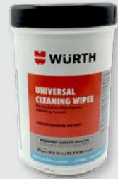
Art. No. 0890900900 Universal Cleaning Wipes 90 Count MOQ 1 $32.19