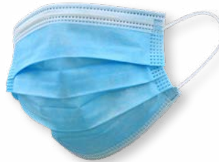
Art. No. 0899011001 3 Ply Surgical Mask MOQ 50 $0.79