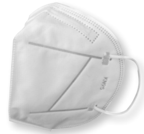
Art. No. CVJKN95 KN95 Disposable Face Mask MOQ 20 $3.49