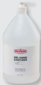
Art. No. CVOS128T2G Gel Hand Sanitizer - Gallon MOQ 2 $29.99

CHECK OUT WWW.WURTHUSA.COM FOR A COMPLETE LIST OF DISINFECTING, SANITIZING AND PERSONAL PROTECTION ITEMS!