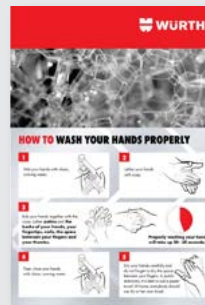
Art. No. CVSD12436 Hand Wash Poster 24" x 36" MOQ 5 $14.99