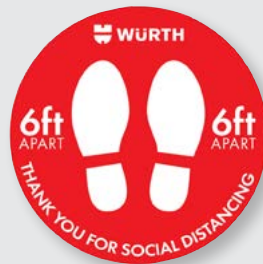
Art. No. CVSD11212 Social Distancing Adhesive Floor Sign Round 12" MOQ 5 $15.99