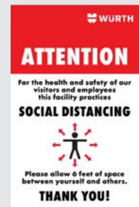
Art. No. CVSD11218 Social Distancing Adhesive Poster 12" x 18" MOQ 5 $13.99