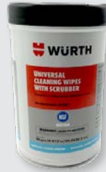
Art. No. 0890900901 Universal Wipes / Scrub 90 Count MOQ 1 $35.05