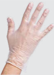
Art. No. 9501006735 M Art. No. 9501006736 L Art. No. 9501006737 XL Vinyl Disposable Gloves MOQ 10 $10.99